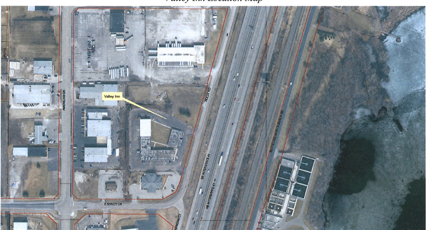
Valley Inn Location Map

Staff recommends approval of the renewal of the Hotel/Motel License for the Valley Inn, 2000 Holly Rd., for July 1, 2020 to June 30, 2021.